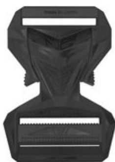
45 MM MALE AND FEMALE PART